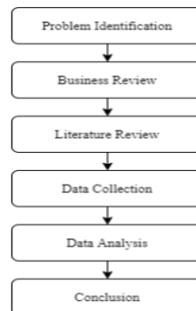
Figure 3: Methodology

readiness to make organizational changes, from traditional organizations to learning organizations by conducting a readiness test to change to a learning organization organization that referring to practical steps to start efforts to build a learning organization developed by Peter Senge, namely The Dance of Change-Generating Profound Changes. The steps of a profound change process to realize a model learning organization. Next is to prepare the data collection method that will be explained in the data collection section based on . After the data is collected, the author can process and analyze the data, then explain the results. The final step is to make conclusions from the analysis of the research results.