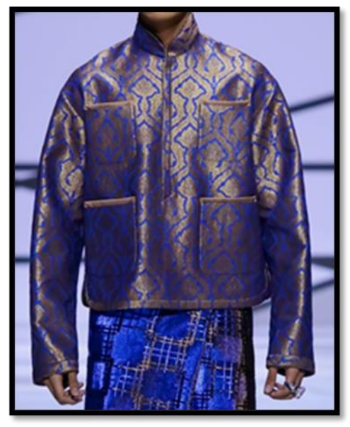
Figure 1: Islamic Motif on Baju Melayu

Additionally, clothes without motifs will look lifeless or tasteless (Fatema, M. and Islam, M.A. 2014). However, after modern globalisation, there are various motifs commonly used as pattern ornaments in the trend of male festive apparel in Malaysia from the 1990s to the 2017s. From the early 1990s, the production of the male garments of Baju Melayu started using printed motifs and bright colours in their textiles. The beauty of composition and motif processing in the development of clothing trends illustrates the progress and creativity of designers in producing their artistic outcomes. Pattern designs and motifs are classified as visual arts because of the contents found on them in terms of objects, motifs, compositions, or arrangements, where they can get a reaction in terms of aesthetics.