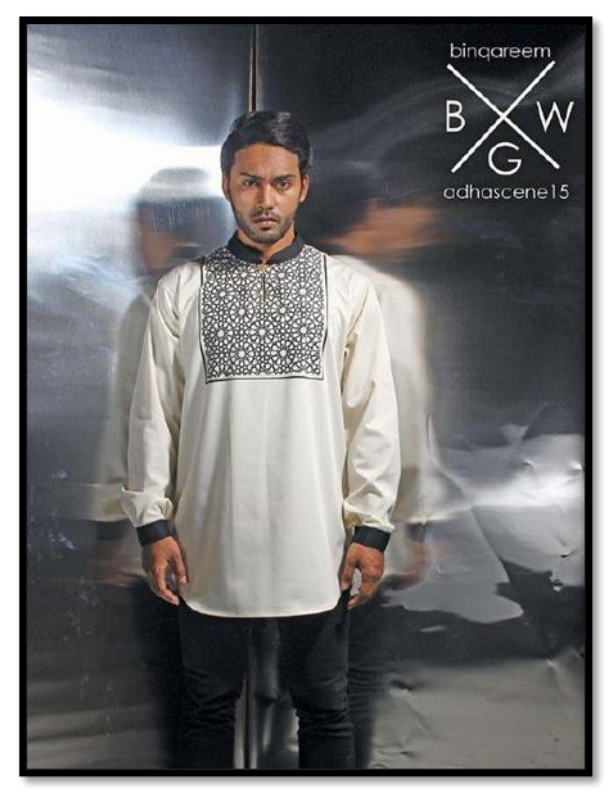
Figure 2: Islamic Motif on Kurta.

The figure and table description above show the motif decorations on modern Baju Melayu for men in 2017 came up with the Islamic motifs using numerical method in repetitive and full forms on the set of this festive attire. According to research carried out by Salman in Amer Shaker (2004), the numerical data is extracted using CAD data capture features. A simple horizontal and vertical translation produces the end result. Meanwhile, in terms of motif compositions, there are various directions: from the top, side, middle, and bottom of the shirt. The layouts of motifs used Islamic motifs arranged repeatedly and vertically up to the neck. The motif is also placed on the hand and up to the trousers.