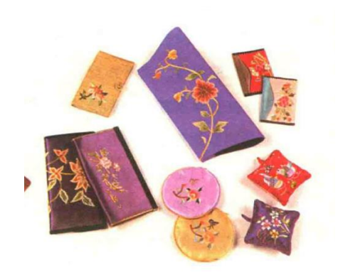
Figure 2: Manchu Embroidery Tourism Products(xifeng, 2015).

used appropriately. Therefore, it is necessary to comprehensively study the traditional attributes of Manchu embroidery to provide support for its cultural sustainable development. Figure 2 shows the tourism products developed through the traditional embroidery elements of the Manchu people(xifeng, 2015).