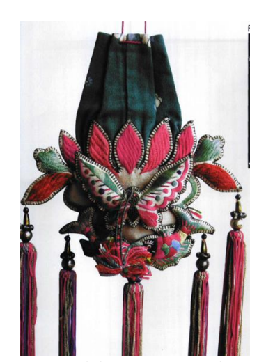
Figure 1: Manchu Traditional Embroidery (Youyou, 2007)

The craft of Manchu embroidery is typical of the northeast region where the Manchu people gather, and it is a craft that has existed there for a long time(Jingdan, 2017). Due to the national characteristic of riding and shooting and the influence of European art styles flowing in the late Qing Dynasty, Manchu embroidery formed a unique style(Xiaoxu et al., 2022; Yang, liu, 2021). Manchu embroidery is known as "royal embroidery"(Guiping & Rui, 2022; Xinyu, 2020). These traditional cultures, formed through the customs of the Manchu ancestors, are of special significance and are fundamental to the collective material culture and national identity of the Manchus, which is their most important national culture. However, in the social changes, Manchu embroidery skills have been discontinued and endangered(Lina, 2021). LiuhuanHuan (2016) thinks, the continuation of the traditional craft of Manchu embroidery through new forms has been a long-standing program and goal of the Manchu region to assist in its preservation. According to Jingwen Wei(2023)research, many Manchu cultural and creative products simply apply a common Manchu symbol or un-researched visual graphic to cultural and creative products, and there is a lack of cultural output behavior. Figure 1 shows traditional Manchu embroidery(Youyou, 2007).